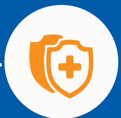
Established safety program

Find out how ABM's services help you exceed expectations. For more information visit ABM.com/Mfg or call us at 866.624.1520