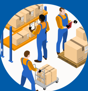
Large labor pools