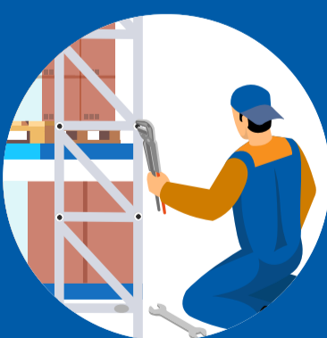
Expert facility services

When you can rely on your facility to operate efficiently — and with full staff — you can focus on meeting customer expectations. ABM services 70+ warehousing and distribution center clients nationwide. From managed staffing to preventive maintenance, we've got your back.