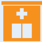
Ambulatory Surgical Centers

45+ million pounds of linen distributed annually.