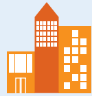
Medical Office Buildings